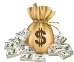
Word List: cheated, climbed, house, Jericho, money, salvation, short, sinner, sycamore, tax collector

What did Jesus do that made Zacchaeus happy? _____